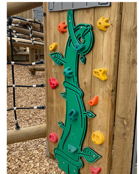
Beanstalk Climb Wall