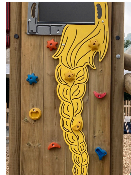
Rapunzel Climb Wall