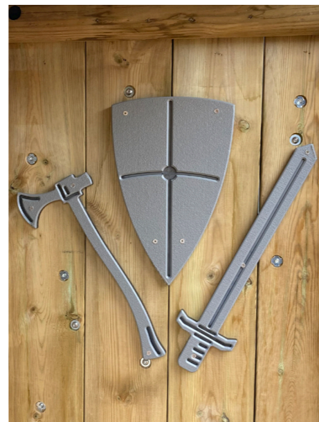
Under Deck Armoury