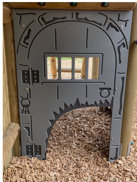
Under Deck Dungeon